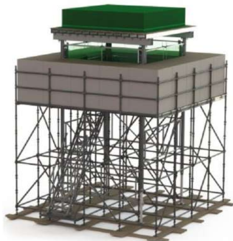
Expeditionary Elevated Sangar (EES)